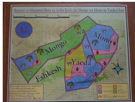
A map of land use zones in Yaeda and Mongo wa Mono villages incorporating designated areas for hunter-gathering

UCRT work in the area extended and recently resulted in obtaining CCROs for 38,000 hectares of Barabaiga grazing lands.