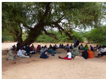
Sharing experiences with local communities

The group ranch system found in Naibunga contrasted strongly with the tenure system found in the second area visited: Garba Tula District, Isiolo County, hosted by the Resource Advocacy Project. Here communities live on and manage 'trust land', which is held in trust for the community by the County Council. Land use and its management is more similar to the customary systems of the Boran inhabitants. Though negative incidents in their history caused the breakdown of their customary institutions, Boran leaders are reestablishing and adapting them including their formalisation as by-laws.