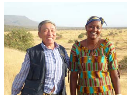
Mongolia shares experiences with Tanzania on the learning route across East Africa.

The journey then moved to Tanzania where UCRT (Ujamaa Community Resource Team) with Terrat community shared experiences of village land use planning (see pg 5) and conservation easements. These have improved livelihood options as well as provided greater security to land and resources.