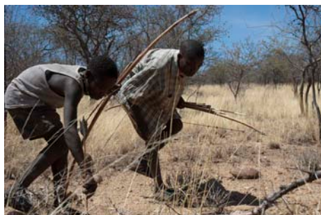
Hadza hunters tracking wild animals for food

The Hadza (or Hadzabe) are one of Tanzania's most unique and threatened communities. Through the centuries they have developed a deep knowledge about the use of natural resources. This has enabled them to survive in a highly challenging arid environment. They depend on natural products such as berries, tubers, baobab fruits, honey and wild animals for food; they do not raise any livestock and they do not cultivate the land.