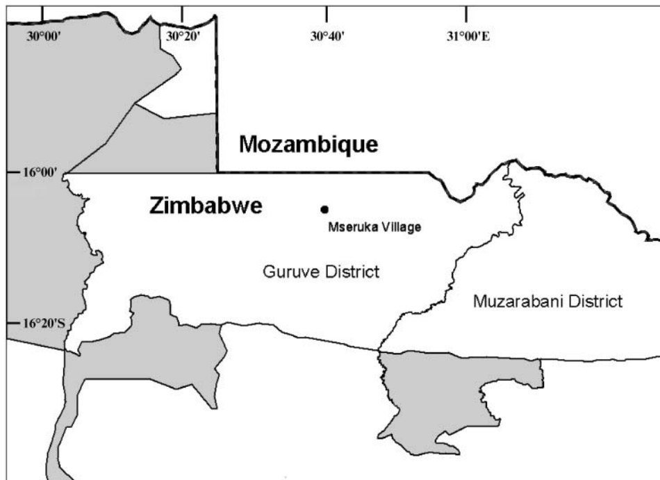
Fig. 1 The location of Mseruka village within Guruve District, northern Zimbabwe. Protected areas are coloured grey.

To test the palatability of different crops we planted 40 trial plots, 10 each of chilli, cotton, maize and sorghum, in the wet season of 2003. Plots were located in unprotected bush land 100 m from the edge of agricultural fields in Mseruka village, Lower Guruve District (Fig. 1). Each plot was c. 10 * 10 m and was planted with 100 propagated seedlings of 10 cm height. The plots were established at the onset of the rainy season and were abandoned at the end of May, in synchrony with local agricultural activities.