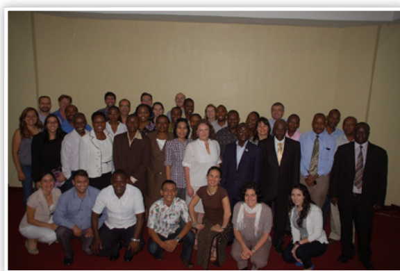
REDD+ SES Global Exchange Meeting participants

The workshop was opened by the Assistant Director of Environment in the Vice President's Office and was attended by participants from Peru, Guatemala, Brazil, Mexico, Indonesia, Nepal, Liberia, DR Congo, Ecuador and Tanzania. The Tanzanian delegation included all members of the National REDD+ Task Force and the Technical Working Group on REDD+ safeguards and governance as well representatives of the Royal Norwegian Embassy, the Institute of Resource Assessment (University of Dar es Salaam) and UN-REDD Tanzania.